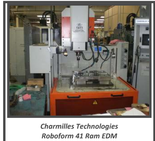
Charmilles Technologies Roboform 41 Ram EDM

Read the MSDS specific to the products in use at your facility for detailed information on the health effects of exposure to beryllium.