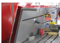
LOCAL EXHAUST VENTILATION GRINDING HOOD

The use of engineering and/or work practice controls are the preferred methods of controlling exposure to beryllium-containing particulate.