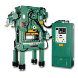
TYPICAL PUNCH PRESS

The inhalation of beryllium-containing dust, mist or fume can cause a serious lung condition in some individuals. The degree of hazard varies depending on the form of the product and how the material is processed and handled. You must read the product specific Safety Data Sheet (SDS) for additional environmental, health and safety information before working with any beryllium-containing alloys.